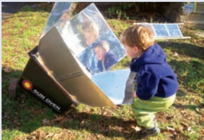
Aidan patiently waits for another delicious treat baked in the family's solar oven.

Step Three. A story in Home Power introduced me to UltraTouch, a recycled denim insulation. At 5.5 inches thick, it has an R-19 insulation value. I loved the idea of using a nontoxic material that required no gloves or masks. For only $300, I insulated two-thirds of our bungalow's main subfloor area. The material stays in place between the floor joists without staples or nails. New windows are coming soon, but for now, the insulation makes a huge difference.