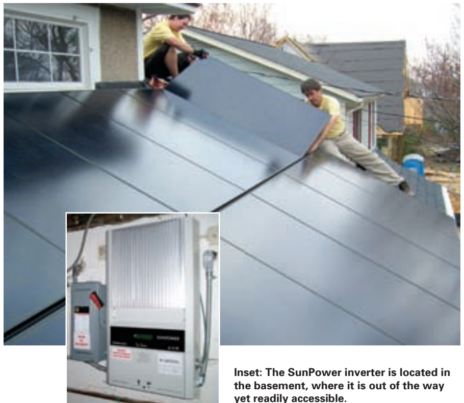
Inset: The SunPower inverter is located in the basement, where it is out of the way yet readily accessible.

Because we positioned the modules on the west-facing front roof, the system works predominantly in the afternoon. Had we been able to face the modules south, we could have gained at least 10% in system output. Even still, the system has exceeded our expectations. As of early January, the system had generated more than 1,700 KWH of electricity since its installation in April 2007. The system was most productive (continued on page 55)