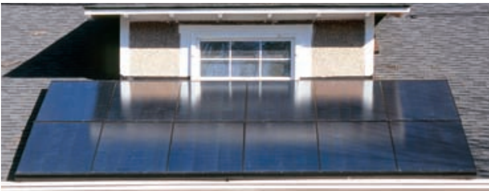
This grid-tied PV system allows Dan and Margaret to enjoy lower electric bills while reducing their consumption of fossil fuels.

The finished product: A 2.6 KW grid-tied solar-electric system with twelve 215 W SunPower modules on the roof and a SunPower 3.3 KW batteryless inverter in the basement. We rarely lose power from the grid, so backup electricity was not a priority. It was more important for me to spend our money on modules that generate electricity rather than on batteries to store it.