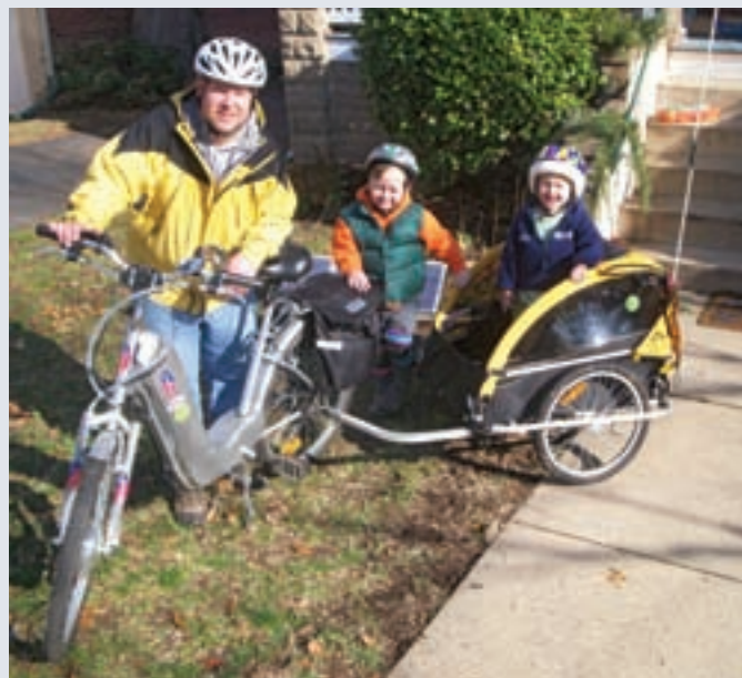
The Redmonds replaced their second car with more sustainable transportation—an electric bicycle that's charged by their PV system.

Step Four. At a home-improvement store, I spotted a stack of 10 W PV modules that are used to power vent fans and wondered what else I could use them for. I bought three, and paired them with a single, deep-cycle marine battery and an 800 W inverter. We power all sorts of devices by plugging into the inverter's outlets. Small power tools, lamps, stereos, and even an electric vehicle—well, my boys' battery-operated Power Wheels kiddie car.